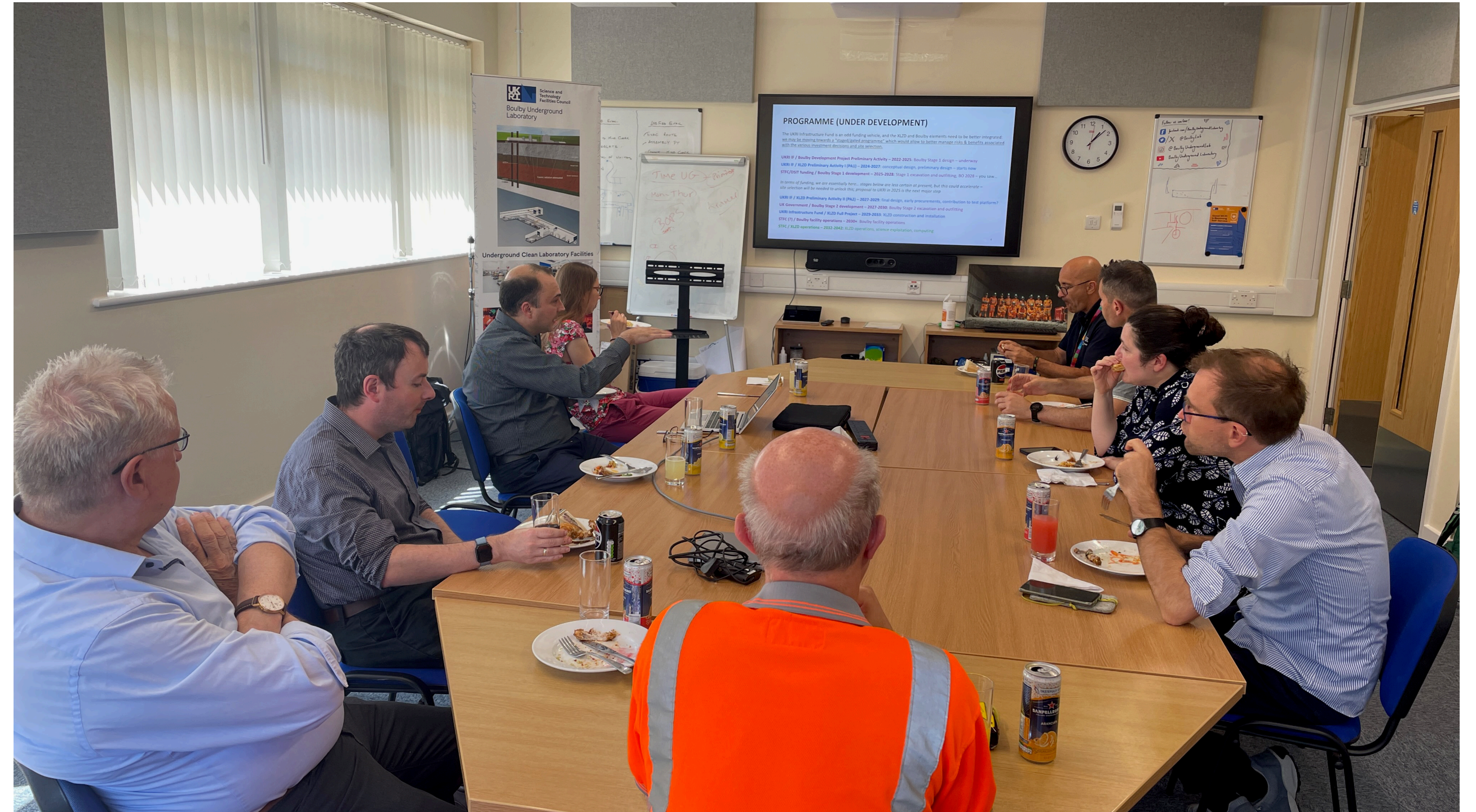
German delegation visit to Boulby