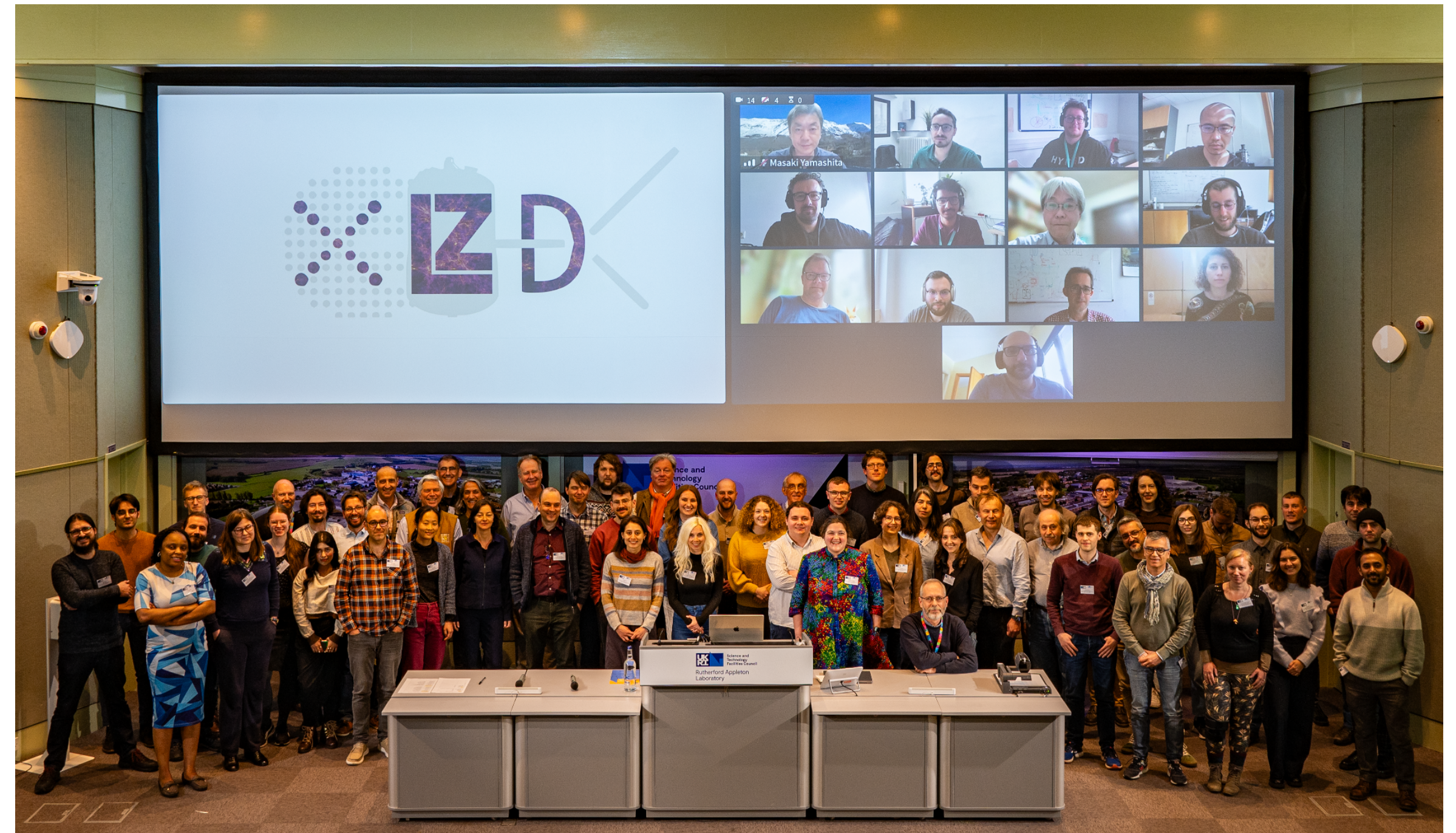
XLZD Meeting at RAL (April 2024)