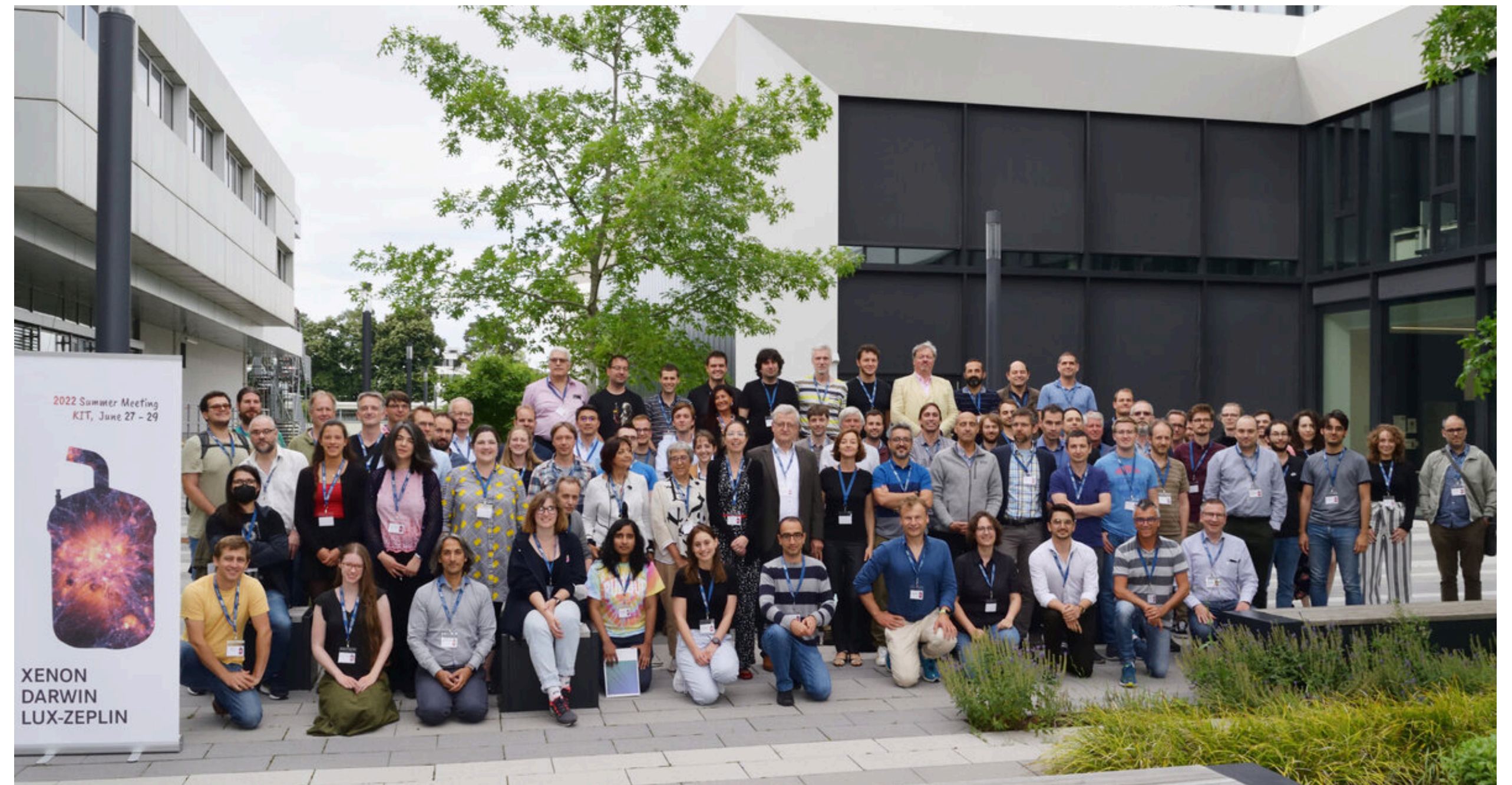
XLZD Meeting at KIT in Karlsruhe, Germany (June 2022)