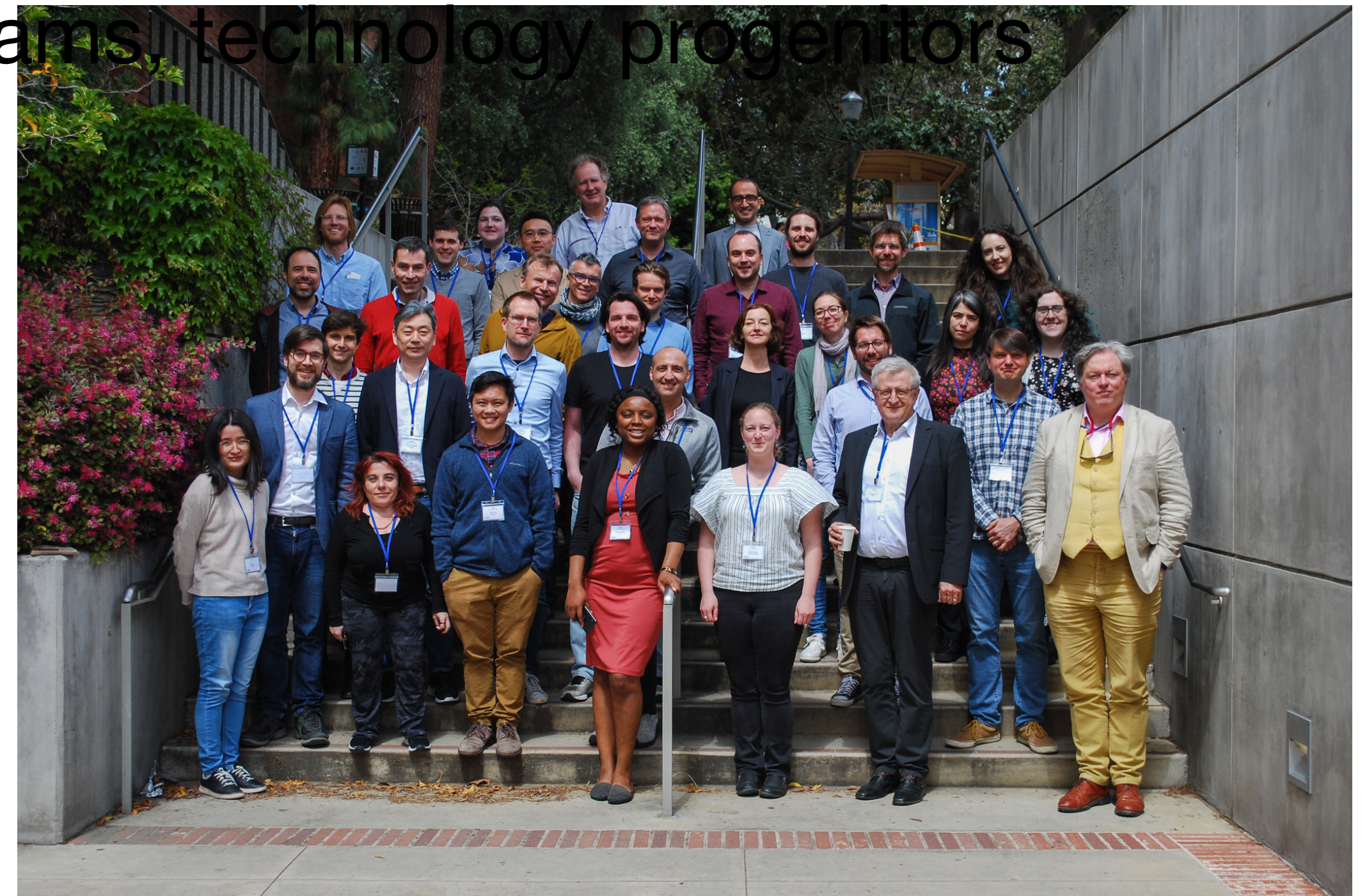
XLZD Meeting at UCLA (April 2023)