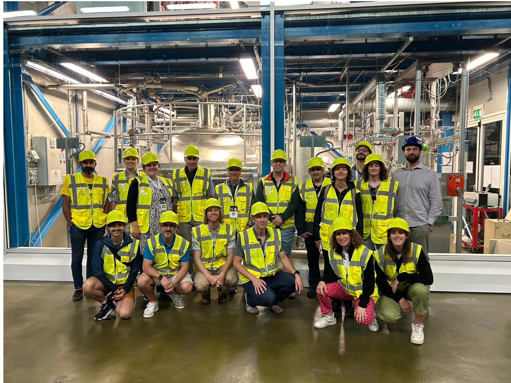
IDM visit to LNGS