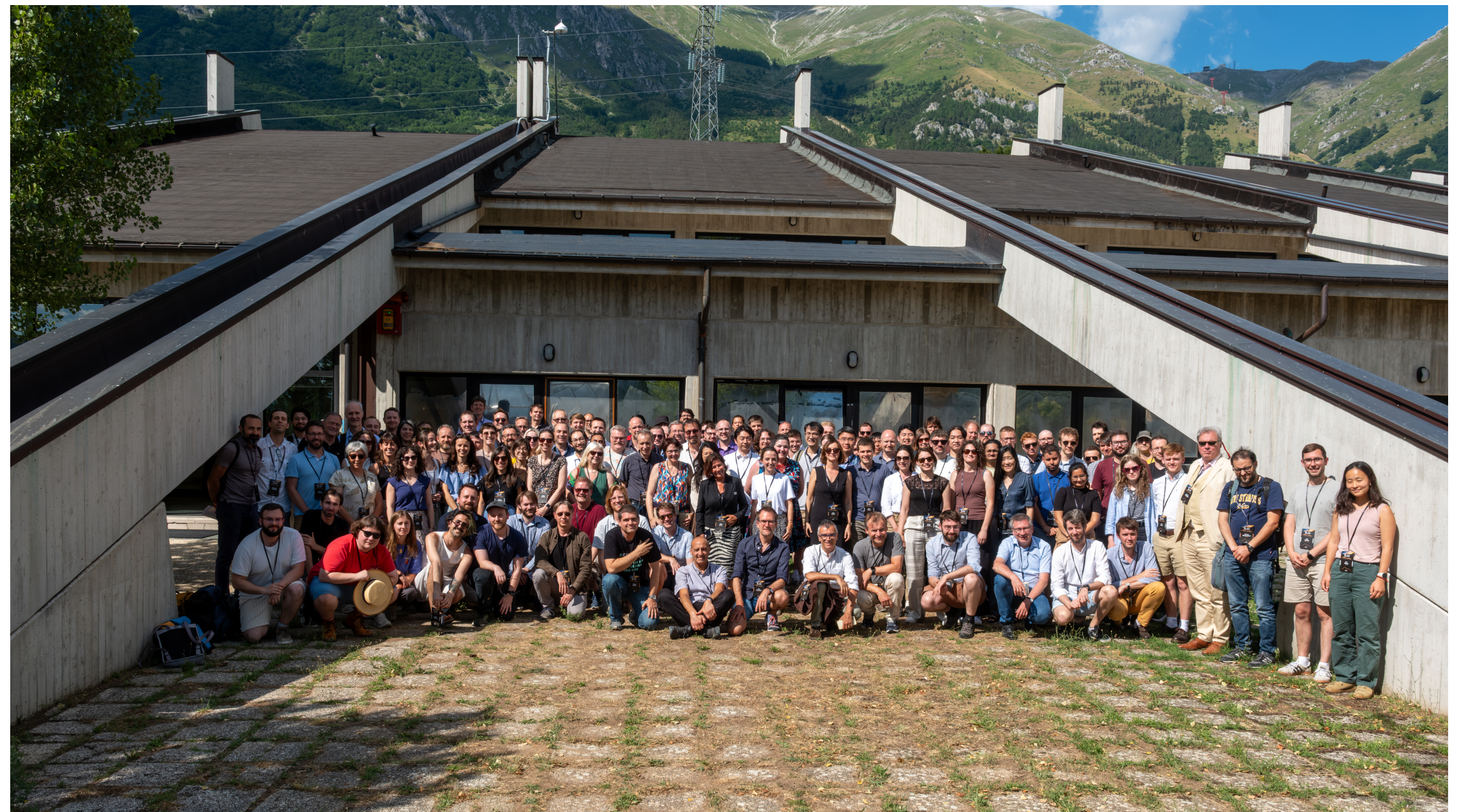
XLZD Meeting at LNGS (June 2025)